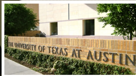
GLOBAL VENTURE LAB INVESTMENT COMPETITION AT UNIVERSITY OF TEXAS AT AUSTIN