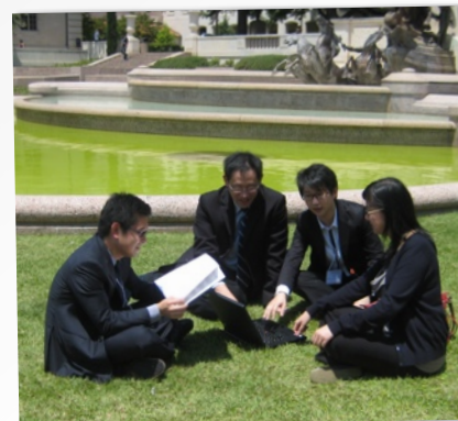
DISCUSSION AT TEXAS AUSTIN CAMPUS